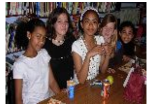
Peers (a pair of Grade 6 tutored students)

"We've had 10 to 15 tutoring sessions. We wanted better marks - especially in math and French. Marks were in the 50's and improved to the 80's. Tutors have the time to help and know how."