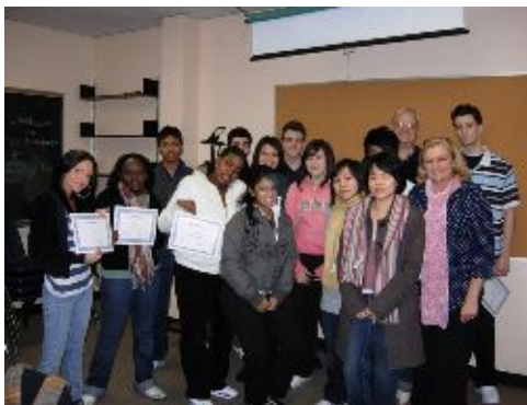
A critical mass of tutors transforming lives.

"Through our tutoring experience, my tutoree gained a friend, confidence and valuable communication skills. My peer arrived in Canada only half a year ago so I believe that our tutoring session did help her feel more welcome... Overall, I think I not only made a difference in her studies, but also in her life."