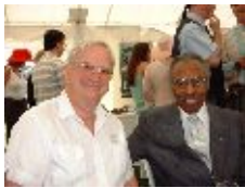
L2L's Patron, right, and President

The Honourable Lincoln M. Alexander, PC, OC, BA, LLD, Patron